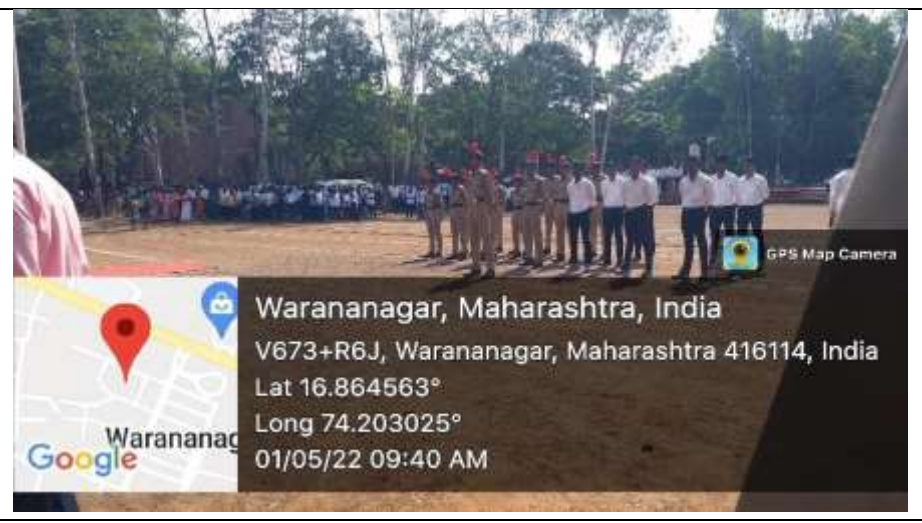
Celebration of Maharashtra Din and Kamgar Din at Warana Complex