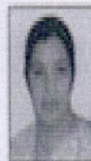
Smt. D. Parandewari Union Minister of State for HRD