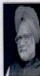
Dr. Manmohan Singh Hon'ble Prime Minister