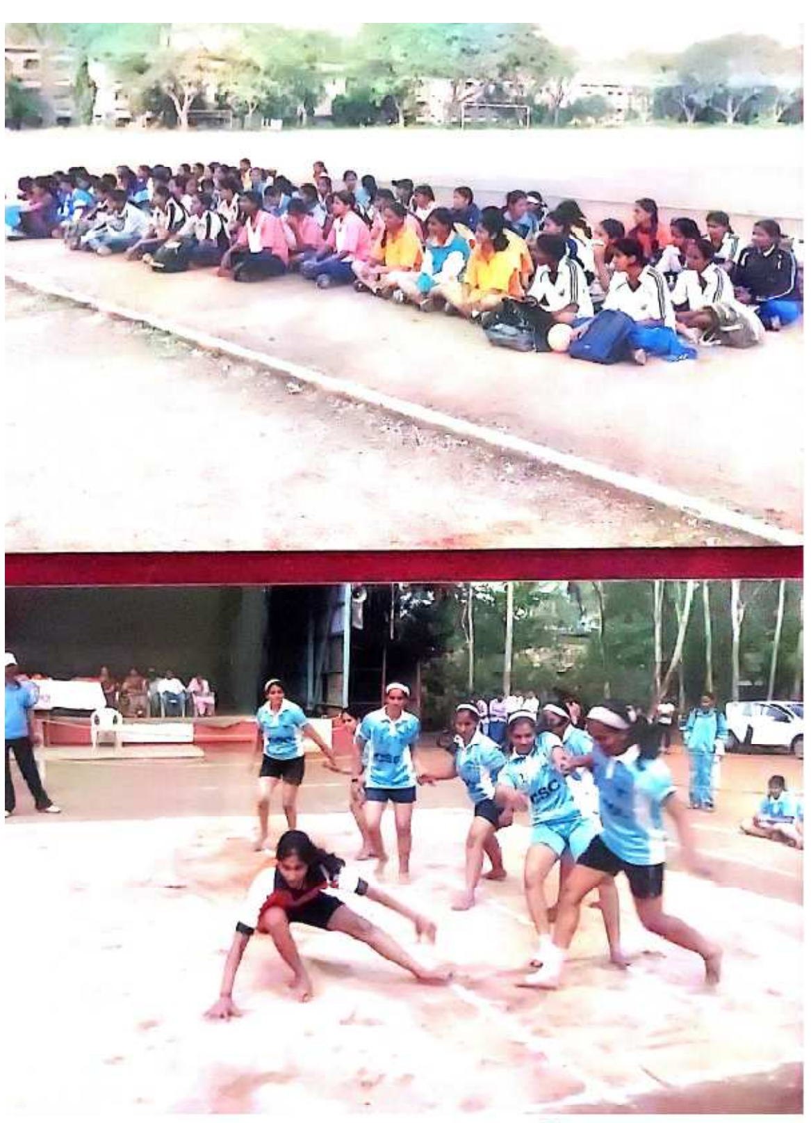
Scanned with OKEN Scanner