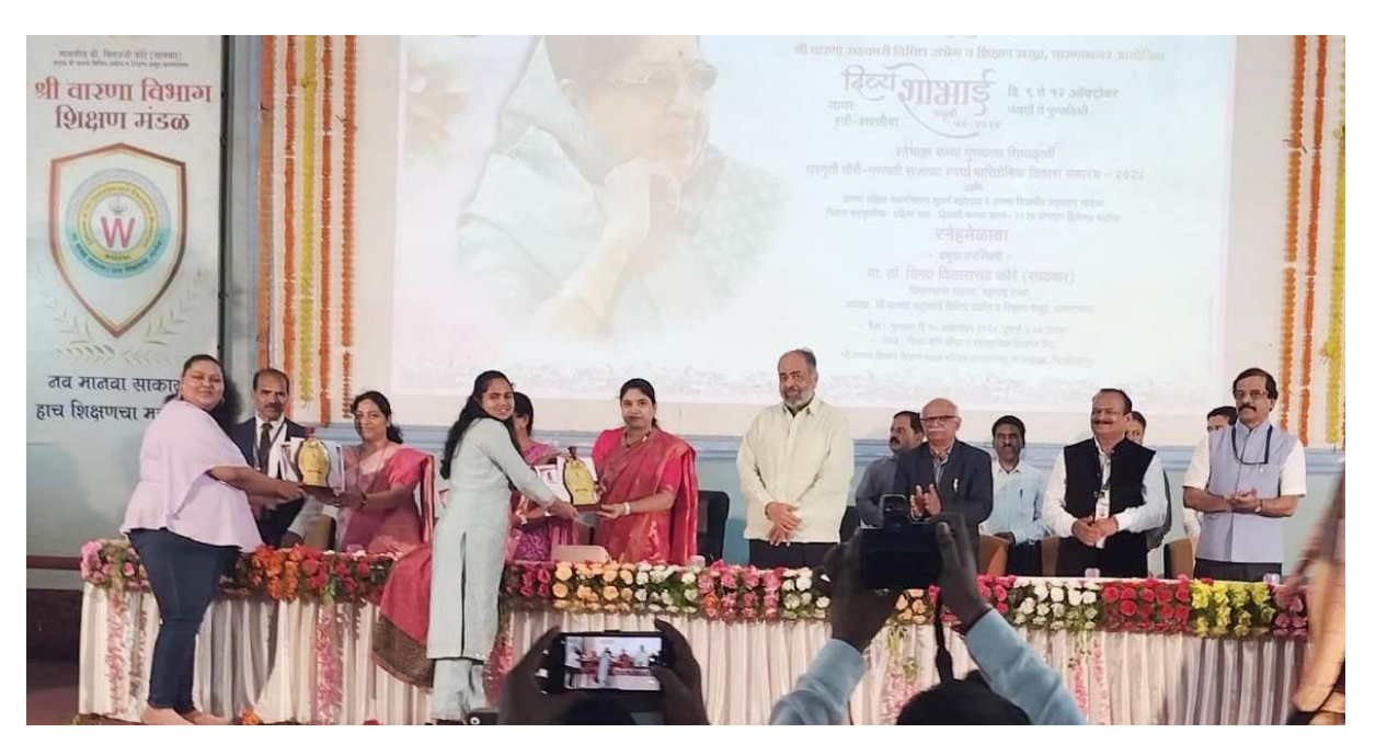
Scholership given to ranker girl students of each \, graduation class, in memory of Shrimati \, Shobatai Kore on 12/10/2023