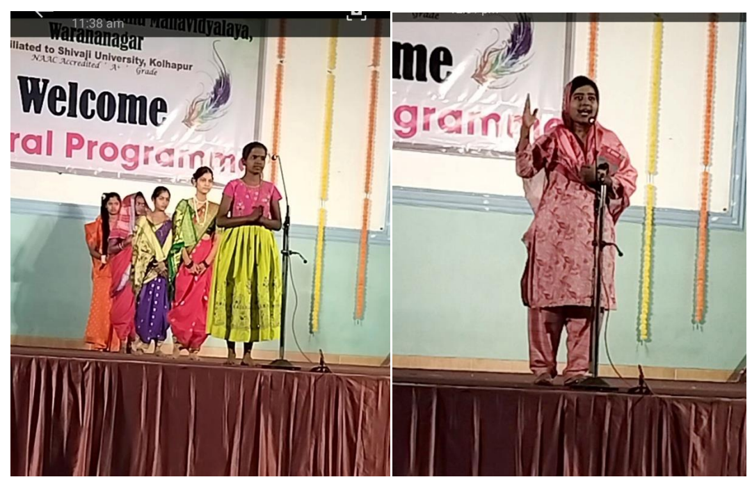
Cultural program 12/1/2024